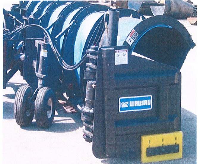
Eliminates spillage on ramp areas or runway

Schmidt Engineering & Equipment, Inc. 1905 South Moorland Road New Berlin, WI 53151-2321 262-784-6066 - 800-788-6066 262-784-6720 Fax ISO 9001:2000 certified