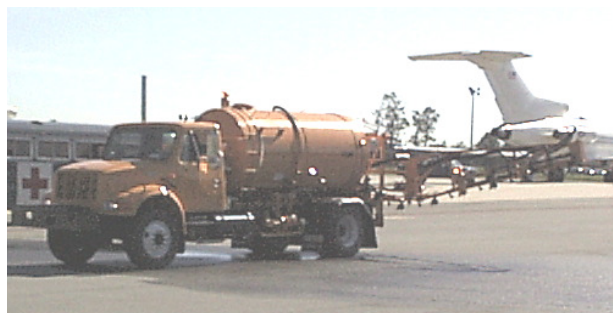
Andrews Air Force Base - 2000 gallon, w/50' booms