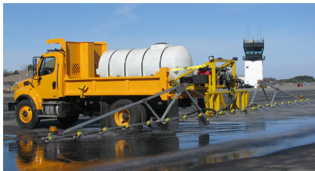
Ithaca - 1000 gallon slide-in unit, w/50' booms