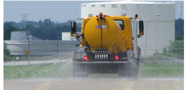
Indianapolis - 1500 gallon, boomless ramp deicer

1905 South Moorland Road New Berlin, WI 53151-2321 U.S.A. 800-788-6066 ~ 262-784-6066 262-784-6720 fax