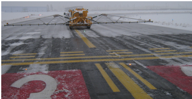
Spokane -1100 gallon TAD w/50' booms