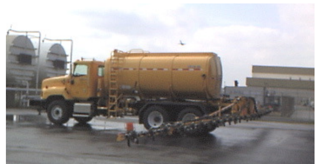
Atlanta Intl. Airport - 4000 gallon, w/75' booms