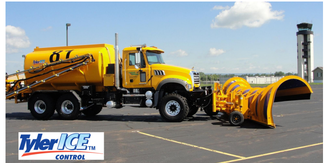
Allenton, PA - 3500 gallon, w/75' booms