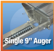
Single 9" Auger