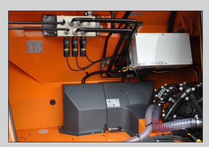
All of the vital components are located in a sealed and locked engine compartment and thus protected from salt dust. The machine is also designed to be user-friendly – both for the driver and service personnel.