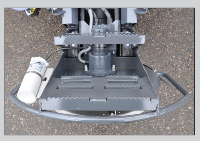
Wide steps on the spreading disc arrangement means safe and easy access to the engine compartment.

The durable liquid tanks are made from thermoplastic material, which is resistant even in extreme climate conditions.