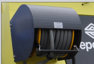
Optionally, hose drum can be mounted.