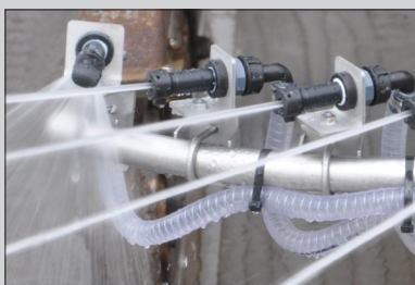
High-speed spreading using Spratronic nozzles. Spreading at all speeds of up to 90 km/h.