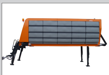
Modular liquid tank.