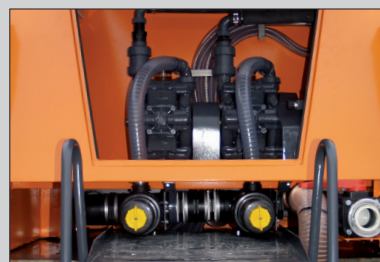
Service-friendly engine compartment with fast access to the computer unit, valves and liquid pumps.