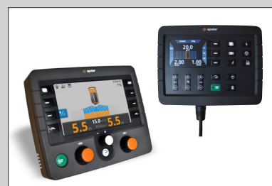
Remote control options: EpoMini X1 or EpoMaster X1.