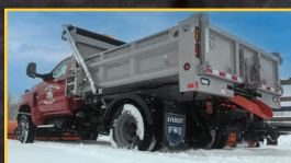
SPREADERS & COMBO BODIES