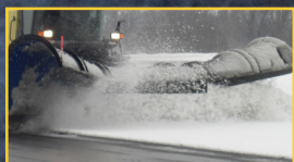
BLUE MAX HIGH SPEED PLOWS

FULL LINE OF SNOW & ICE EQUIPMENT FOR MUNICIPALITIES AND AIRPORTS