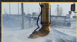
COLD AIR BLOWERS